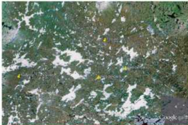
Figure 1. Example of the satellite view (Google Earth) of the location of a proposed project in reference to the nearest town. Please include a scale bar to indicate distances in meters or kilometres.

[Latitude and longitude of the project location must be provided. If on DND property, provide a precise location: e.g. what part of RTA or what street (include civic address) within administrative area. If the project consists of off-site training provide location in relation to the nearest populated place or physical feature: e.g. city, town, lake, park or military installation. Satellite views (i.e. obtained from Google Earth) can be inserted here or provided in an annex.]